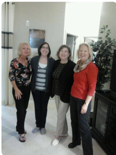
The cousins, 2014